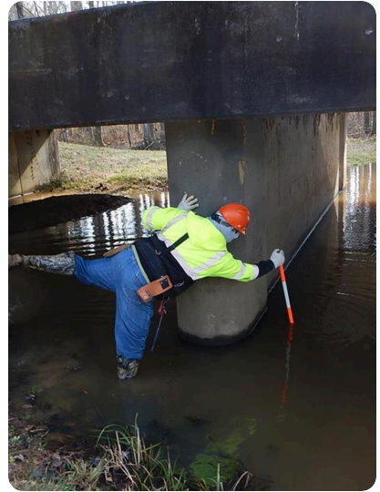
In Mississippi Muck!