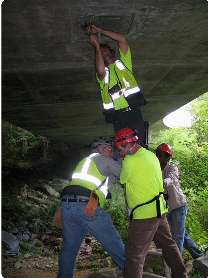
True Team Work!