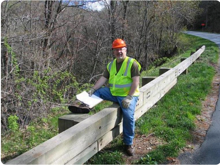
Inspections Blue Ridge Parkway