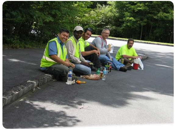
Taking lunch where you can